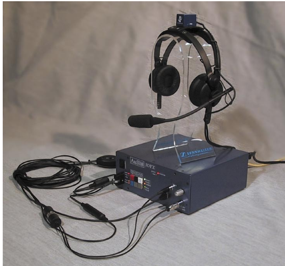
The 3-D Voice Communication Interface System, AuSIM, Inc.'s latest hardware product, connects to a network via ethernet. Each participant uses one system, and the headset is tracked in orientation and global position. Derivatives of this system are being developed for wearable and vehicle applications.

While audio simulation technology has been called "3-D sound," this same title has been applied to spatialized sound and surround sound, which are simpler technologies