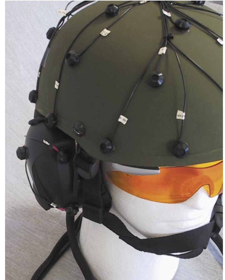
Test System for Studying Spatial Hearing through Obstructing Headgear: AuSIM, Inc.'s 32-channel, microphone-instrumented helmet provides soldiers with situational awareness of their environment, protecting them from potential ballistic, chemical, biological, optical, and percussive threats.