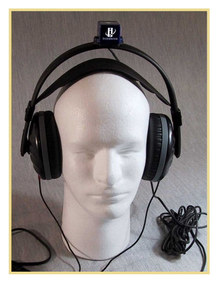
AuSIM headphones, with standard head-orientation tracker mounted on the headband

GoldServe<sup>™</sup> is a complete 3D soundlocalization server subsystem to be a peripheral to one or more "host" computers running a user's applica-