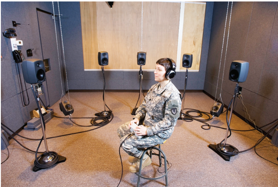
Fig. 6. A soldier listens to speech presented through headphones in the Listening Laboratory. The foam panels within this space can be removed to increase the reverberation time of the space.

The creation of OpenEAR will allow additional research to be conducted (in combination with the Distance Hall) in the area of auditory distance estimation. Previous studies conducted within ARL have taken place in an open field located approximately 5 km from the ART labs. OpenEAR will provide an outdoor research area that will be more accessible by the ART. Previous work by the ART in distance estimation at loudspeaker to listener distances of up to 800 m has demonstrated that individuals grossly underestimate the distance to sound sources and that errors increase non-linearly with distance. 9 At distances of less than 20 m, listeners are fairly accurate but estimates drop off at distances as short as 100 m. Further work in this area is needed to evaluate the reasons for this and to deter-