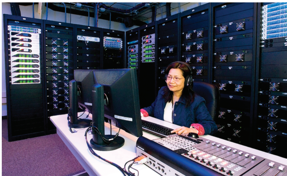
Fig. 2. A researcher configures an experiment in the Control Room. Rack mounted equipment is used to control the stimulus presentations in the research spaces.

The Control Room (Fig. 2) permits complete observation and operation of instrumentation and research activities in each of the five research spaces. The Control Room contains the front-end of all of the instrumentation and stimulus generation systems. All switching devices and power supplies needed to operate the loudspeakers within the research spaces are mounted in racks installed in the Control Room. Experimental design and execution is controlled by software