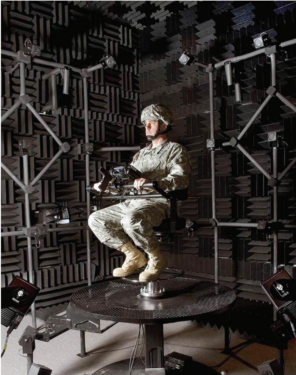
Fig. 3. A participant prepares for an experiment in the Sphere Room. The central location of the listener station and platform allow for the creation of a completely immersive auditory environment.

room to provide background noise when needed. These loudspeakers are each capable of providing background noise up to 110 dBA at the position of the listener. The combination of spherically located loudspeakers and the central position of the listener can result in a completely immersive auditory environment.