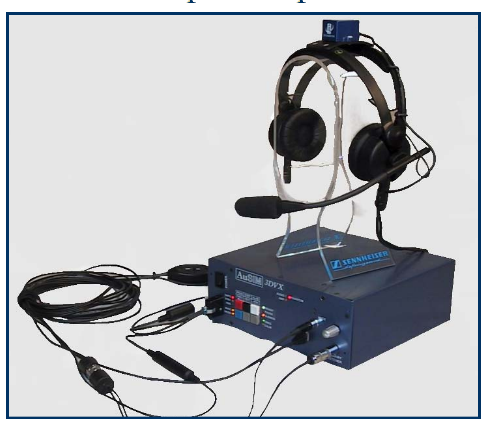
Figure 1 - 3DVX prototype system, now undergoing field trials.

Combining sophisticated algorithms and efficient signal processing with significant computing power, numerous discrete sound sources can be projected in in space around a head-phone-wearing listener.